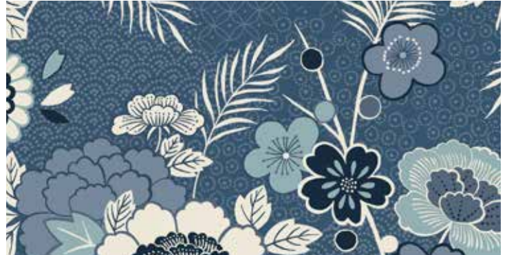
2150/B Floral Montage