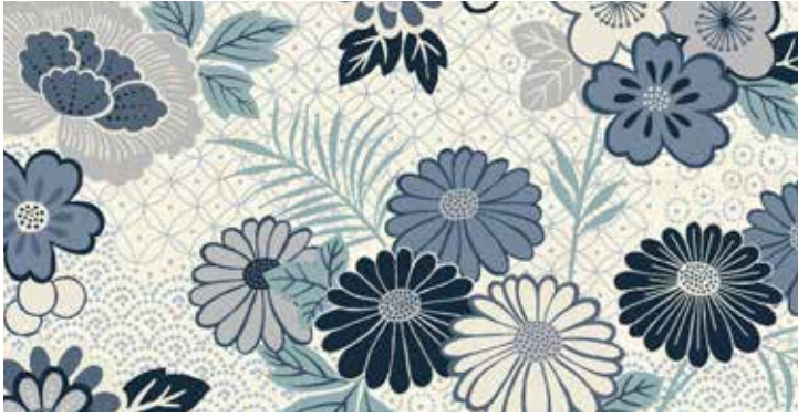
2150/Q Floral Montage